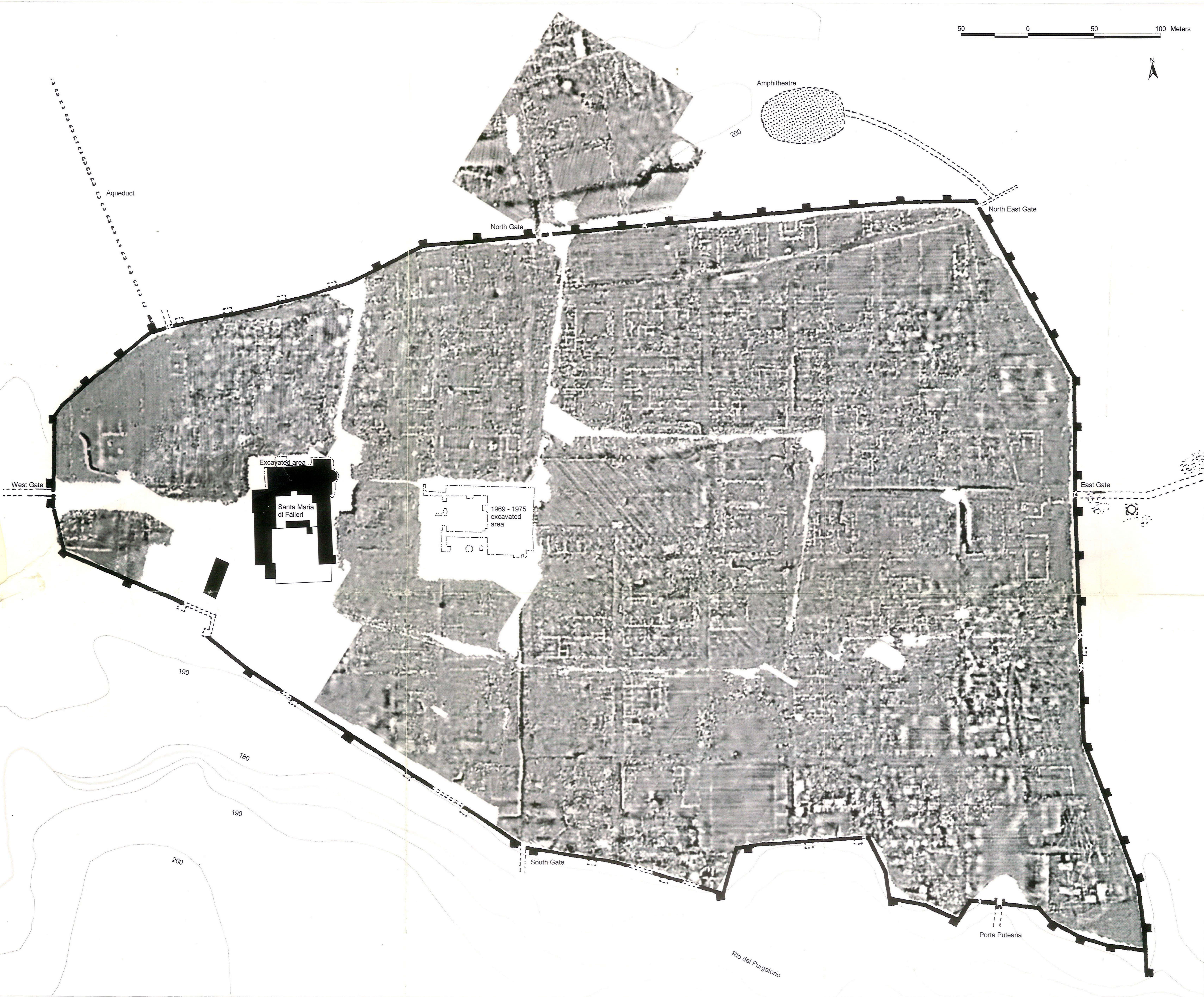
FIG. 6. Results of the magnetometer survey in relation to the city walls, the 1969–75 excavations and the medieval church. The topography of the area outside the walls is based on the cadastral maps (contours in metres). Scale 1:2,000.