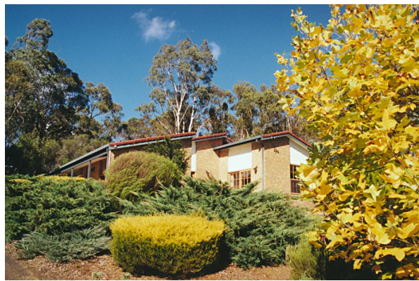
The Australian Tsuchi no Yado