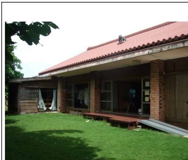
A traditional shisa guardian deity watches over the inn at Iejima

The inn, designed by an architecture student in lieu of his graduation thesis, captures perfectly Kimura’s all-embracing vision. Its walls are open to the elements, there are two large communal rooms and it is fully wheelchair accessible with ramps, low-set light switches and a two-tier stove and sink so people of all abilities can cook together.