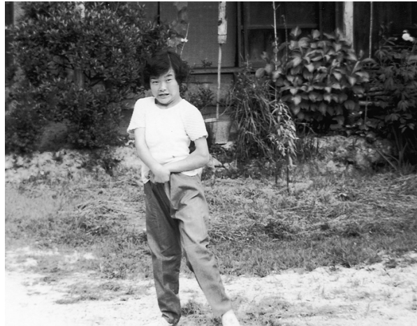
Determination: Learning to walk

infinitely and allowed her to pursue the next stage of her life: poetry.