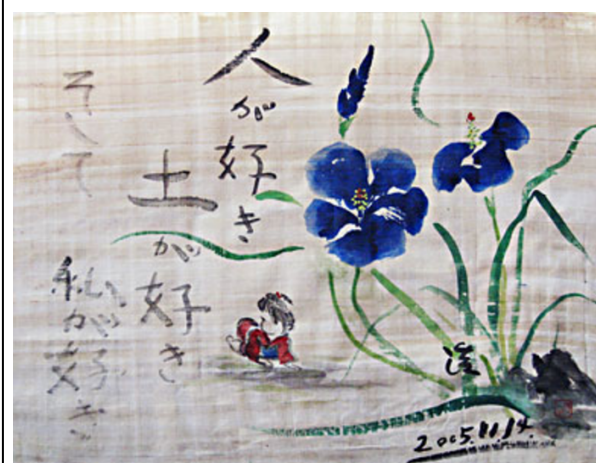
Paintings by Kimura Hiroko