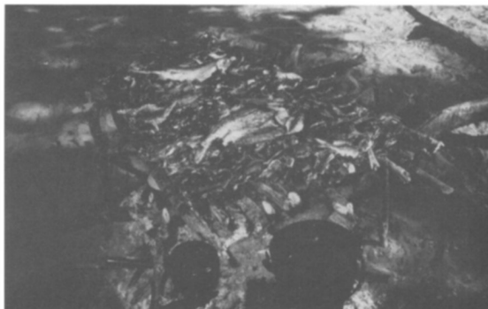
Figure 5. Fish killed by spraying with endosulfan are sometimes smoked and eaten—and are safe.

Many authorities, including FAO, now believe that large tsetse eradication campaigns should be preceded by detailed land-use planning so that, in theory at least, the occupation of virgin territory takes place in a controlled and optimum fashion (Jahnke, 1976; Jordan, 1979). Perhaps too little attention is being paid to the need also to monitor the changes as they occur. Generally, tsetse control departments do not consider the land-use implications of their work, but the National Tsetse and Trypanosomiasis Control Project of Somalia is an exception, considering some of the wider issues of tsetse eradication through an Environment Section. It remains to be seen, however, whether the manner and timing of eradication in Somalia will be influenced by the section's findings. Tsetse fly control campaigns: effect on wildlife