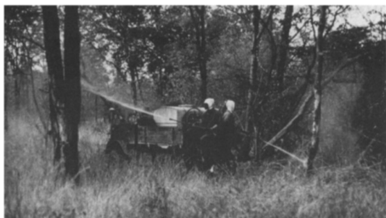
Figure 4. Treating tree trunks in Zambia with residual sprays of dieldrin or DDT in the late 1960s.

non-target organisms. Even small game animals can be killed by dieldrin (Wilson, 1972), although big game in Kenya was apparently unaffected (Allsopp, 1978), and it has been shown that the relative abundances of insects and insectivorous birds remain markedly depressed for at least a year after exposure (Müller et al. , 1981; Koeman et al. , 1971, 1978). A similar picture emerges when endosulfan, another organochlorine, is used at high residual doses (up to 1000 g/ha), except that in this case fish populations can also remain depressed for long periods (Koeman et al. , 1978; Baldry et al. , 1981; Everts et al. , 1983).