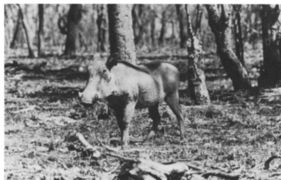
Figure 2. Wart hog: the most important host of savanna tsetse species ( R.J. Douthwaite ).

been effective, but, with the exception of Zimbabwe, this was not the case. Even here there were many setbacks because of game immigration from outside the control areas and failure to eradicate the smaller animals, such as wart hogs, which were hard to see in dense vegetation (Lovemore, 1961). In effect, most tsetse departments had merely been operating rather inefficient game-cropping techniques, and some populations actually increased (Child et al. , 1970). Perhaps of greater significance was the needless destruction of many species that play only minor roles in the disease cycle. It was not until the late 1950s that bloodmeal analyses