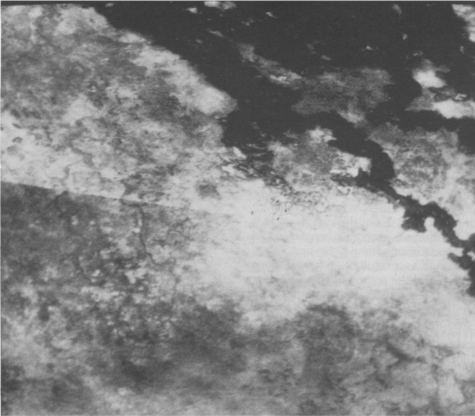
Figure 6. A Landsat photograph of the south-western corner of the Okavango Delta, Botswana, taken on 7 May 1983. The line of the fence separating cattle and game is visible on the left; the paler areas are more heavily grazed, probably by cattle to the south and game to the north. The seasonal migration of zebra from the Delta to Lake Ngami may have been cut at this point.

extent to which they are able to intensify sustained use of the present tsetse-free lands rather than to encourage low-productivity encroachment on 'new' land. In the final analysis, the environmental effects of tsetse control can only be averted by political action.