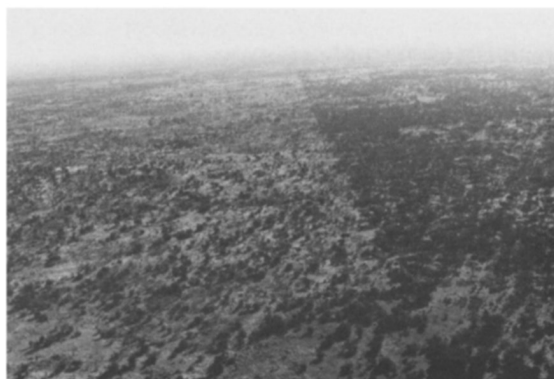
Figure 3. Regenerating woodland in a clear-felled area on the fringes of the Okavango Delta, Botswana.

more likely to be settled by man, so it can be assumed that a significant proportion of these campaigns led to permanent habitat destruction, with the inevitable loss of much of the wildlife.