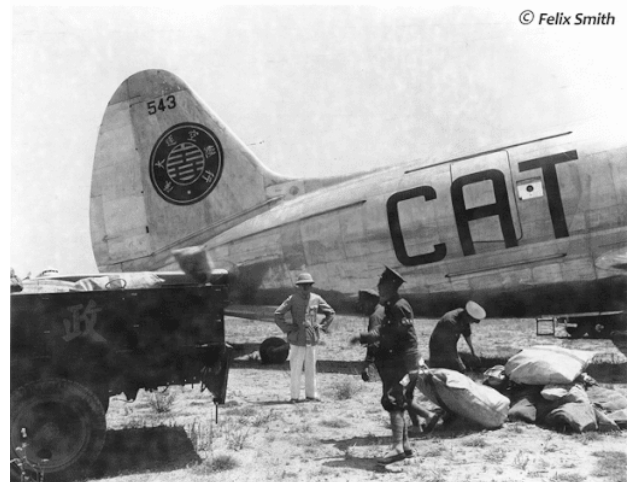
[Mail being loaded onto a CAT plane. ]

At first, UNRRA Director LaGuardia turned down this proposal after he and all other responsible UNRRA officials opposed it as wasteful and unnecessary. However, LaGuardia "was called in for consultation by the State Department and told that both Soong and Madame Chiang had insisted on the need for the airline. LaGuardia reversed himself." 33 The Kuomintang clearly wanted Chennault to stay on to support its widely scattered armies; and indeed when Chennault "got full support of the line, he used it in semi-military support of the Kuomintang." 34