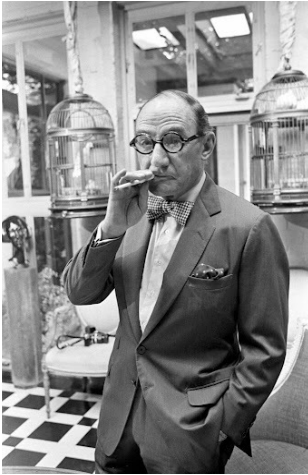
[Joseph Alsop in 1974. ]

This timely visit recalls others. Alsop visited Taiwan and Indochina in late 1953, as the French were making their fateful buildup at Dienbienphu; he was the first to report USAF support for Dienbienphu before announcing his conversion to Chiang's and MacArthur's view that "there was no substitute for victory" in Asia. 23