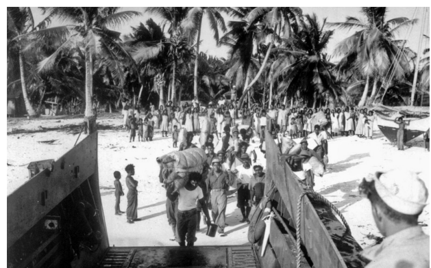
U.S. military forcibly evacuating Marshall Islanders from Bikini Atoll