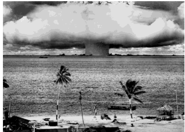
“Bravo Shot” H-bomb test, Bikini, March 1, 1954