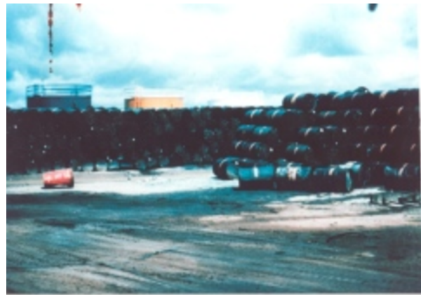
55-gallon drums of Agent Orange.

Meanwhile, the August 8 th presentation helped to facilitate collaboration between Okinawan environmental groups and US veterans who were exposed on the island. Members from both sides have entered into correspondence and there are tentative plans to invite US veterans to Okinawa to identify former storage areas and give talks to community leaders concerned about the health risks. Okinawan groups are also in the process of gathering testimonies from former base workers who might have handled these defoliants - with the long-term goal of producing an epidemiological study.