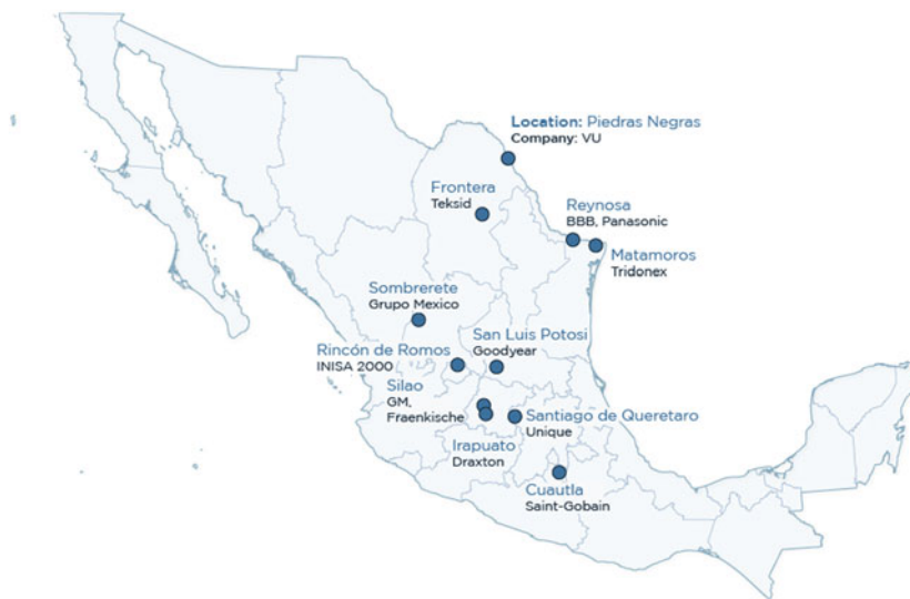
Figure 2. Most US Rapid Response Labor Mechanism situations have targeted Mexico's automobile supply chain

Note: With the exception of INISA 2000 (textiles) and Grupo México (mining), all facilities are in the automobile sector.