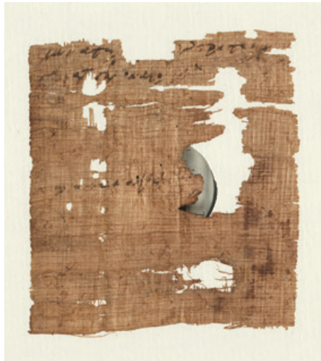
Figure 6.3 Tax receipt issued by Athanasios.

3 γ' μ(ὄγγον): Analogous to P.Mich. inv. 1055 one might assume a repetition of the numeral behind the figure. The double stroke that stretches far to the right would provide enough space, but the gap does not allow for any conclusions.