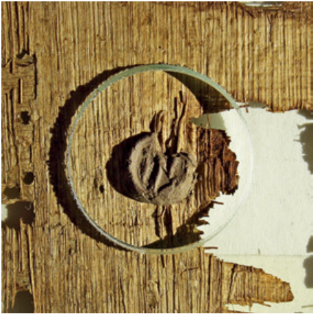
Figure 6.2 Seal attached to P.Vindob. G 41046v.