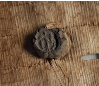
Figure 6.1 Seal (Van Minnen, ‘Tax arrears’, Fig. 2).