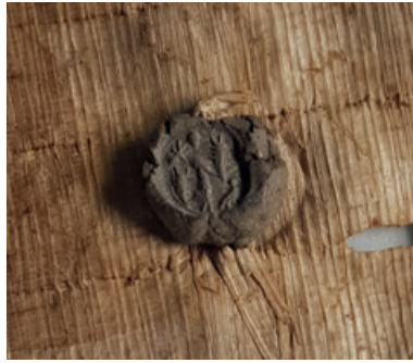
Figure 6.1 Seal (Van Minnen, 'Tax arrears,' Fig. 2).