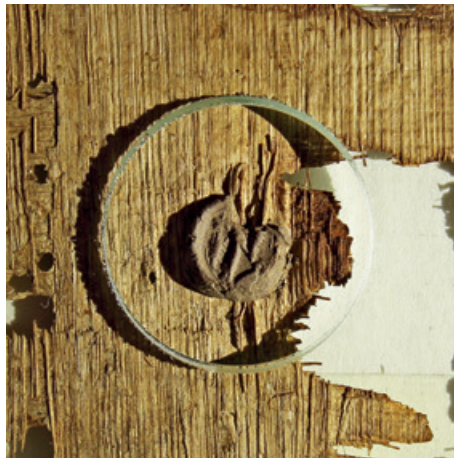
Figure 6.2 Seal attached to P.Vindob. G 41046v.