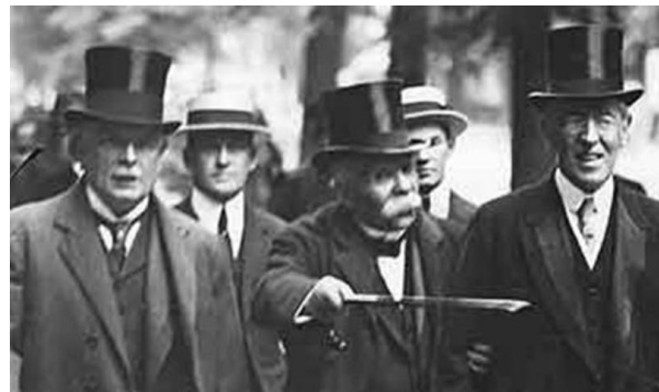
Lloyd George, Georges Clemenceau and Woodrow Wilson arriving at Versailles at the end of World War I

unintended consequence in what came after. I think the League of Nations did provide a skeletal framework for a global order in which equal sovereignty of nation-states would be the basic form but in which British hegemony would be superseded by a collective dominance of Western powers led by the economic dominance of the United States. Karl Polanyi’s The Great Transformation is an instructive lesson in the underlying changes that were taking place in the inter-war years in the global system.