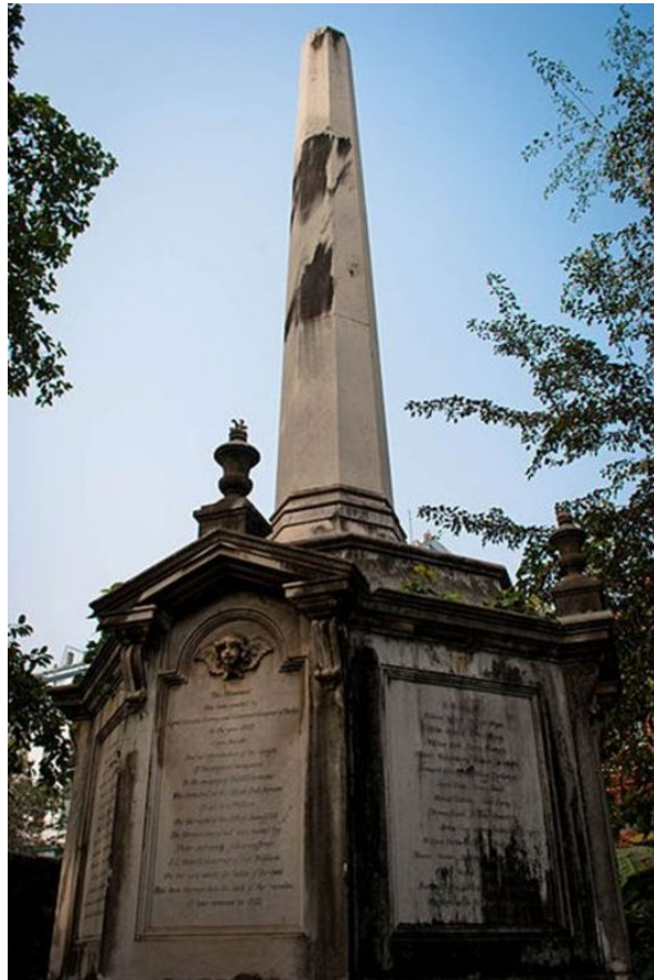
Black Hole Memorial restored by Lord Curzon

Introduction: The Legitimation of Imperial Practices