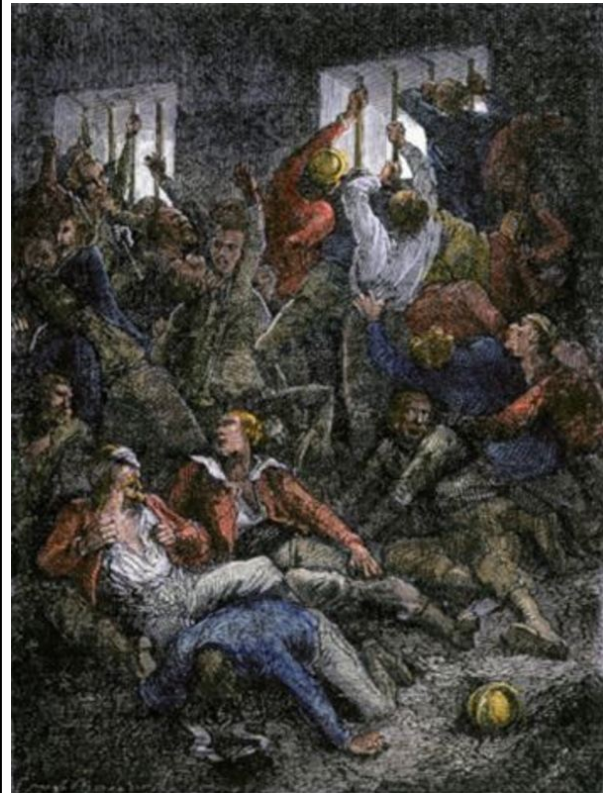
English officers in the Black Hole

conceptual changes in those disciplinary knowledges of power. That is my method. To a large extent, I had to invent it. Whether it works or not is for readers like you to judge.