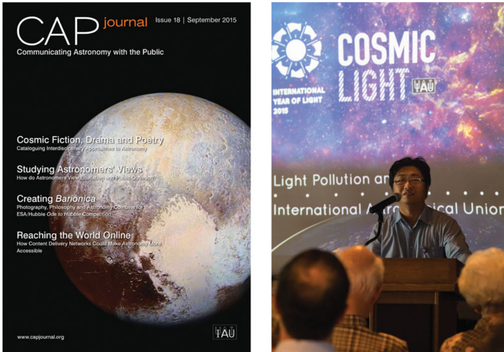
Figure 3. Left: CAPjournal issue number 18; Right: Sze-leung Cheung at the IAU XXIX General Assembly.