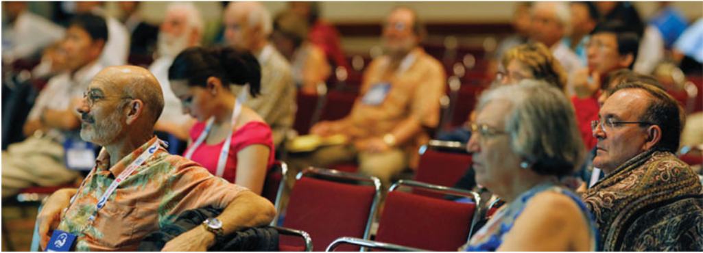
Figure 5. Audience at the Division C meeting at the IAU XXIX General Assembly.