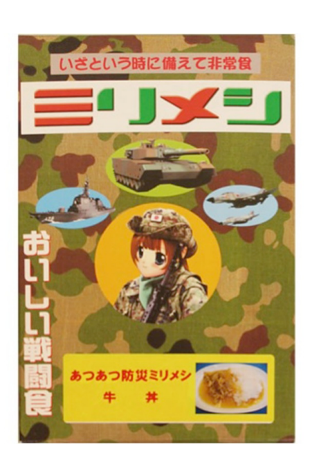
"Military food" turned "emergency food" with a very gendered/sexualized image on the package.

domesticity, and the military is more than implicit.