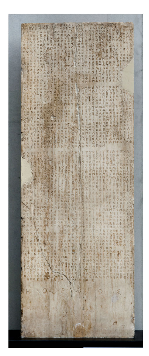
Fig. 1. Athenian decrees concerning the Euboian city of Chalkis, IG 1<sup>3</sup> 40 = OR 131. Aκρ. 6509

An important impetus for inscription was also provided by the monumental development of Athenian public space, 30 specifically of the Acropolis, where the majority of public documents from the middle of the century through to its final decade were displayed.<sup>31</sup> The sacred aspect of this display context must also be emphasized.<sup>32</sup> The link between the gods and inscription evident in the Archaic period was maintained in fifthcentury Athens.33 Many decrees and financial records had sacred content; even those with 'non-sacred' content were sometimes inscribed under reliefs depicting deities or headings invoking the gods.34