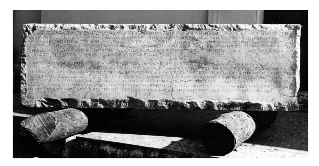
Fig. 2. Thasian laws concerning informers, Pouilloux (1954) no. 18 = OR 176. Thasos Archaeological Museum.