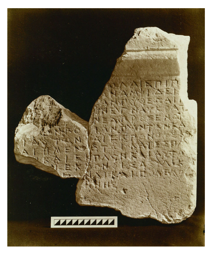
Fig. 4 Proxeny decree of all the Rhodians, Blinkenberg (1941) no. 16.

With these two proxeny decrees, and the few other fragmentary honorific documents, Rhodes shows the highest concentration of honorific decrees in any allied community by some way. This in itself is worthy of comment. But it is even more notable when we consider the productive distinctive and epigraphic culture Hellenistic Rhodes. Strangely, although this kind of document would become widespread in the Greek world more generally, there are no inscribed proxeny decrees from Rhodes dated after these fifth-century examples, even though other categories of evidence show that Rhodes participated in proxeny networks in the late Classical and Hellenistic periods.98 In