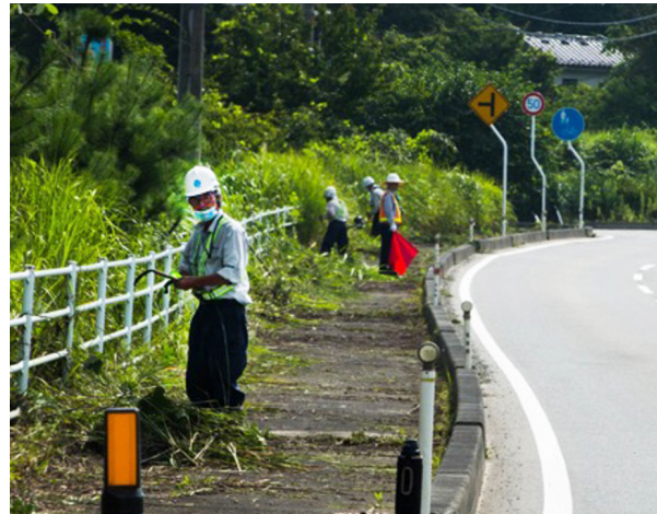
Grass-cutting across from the Fukushima Dai-ichi plant, August 2019

environmental contamination with radionuclides would underscore the criminality of using the Olympics in this state-sponsored disaster tourism scheme.