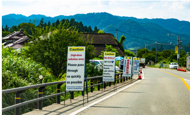
Caution signs include prohibiting pedestrians, August 2019

Olympians and their supporters will run right through these areas, with international television cameras beaming scenes of cheering spectators and pretty countryside around the world. At the same time, recognizing