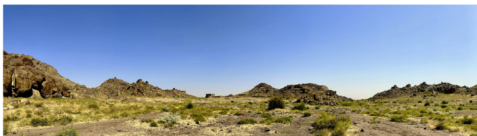
Figure 3. The archaeological site of Jebel Moya, right above the village.