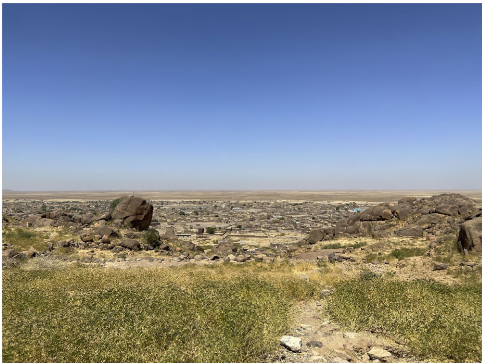
Figure 2. The village of Jebel Moya as seen from the top of the mountain.