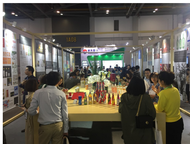
Scenes of exhibits at the FBIF

to potential investors, it didn't work). Unsurprisingly, the longest lines were at the two coffee franchises and two craft beer makers, each strategically placed at a different side of the massive exhibition hall.