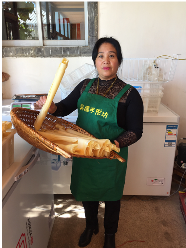
Owner of Handmade Rushan store in her Dali workshop. Most of the shop's sales are made online.

to potential investors, it didn't work). Unsurprisingly, the longest lines were at the two coffee franchises and two craft beer makers, each strategically placed at a different side of the massive exhibition hall.