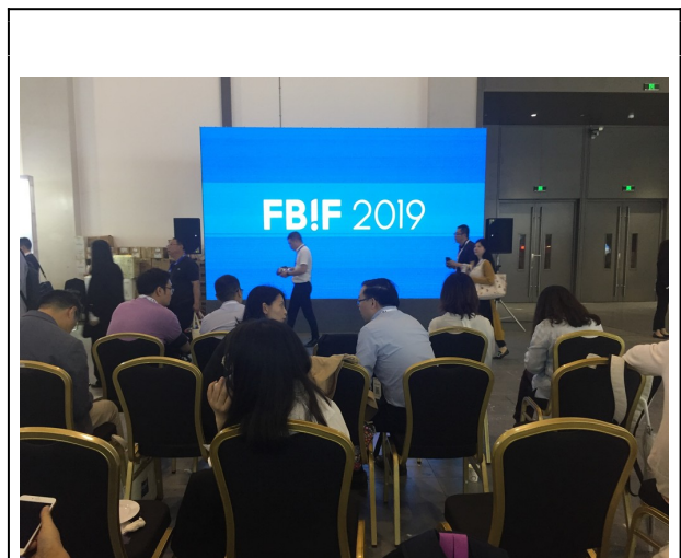
Scene before a breakout session at the FBIF speaker forums. Hangzhou, 2019

Expo 2 was nearly 40 times larger) the FBIF was also more focused specifically on the topic of innovation and emerging trends, and provides a unique opportunity to reflect on the past and future of China's rapidly changing food industries.