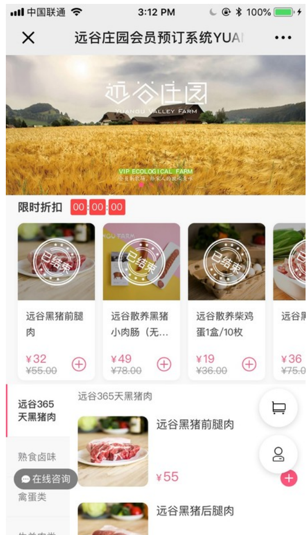
Screenshot of Yuangu zhuangyuan organic farm catalogue. This order form is a mini-program embedded in the WeChat phone app.

New sectors such as organic produce delivery 20 rely on e-commerce to overcome barriers of both distance and trust. Based in the far north of Inner Mongolia, or Yuangu zhuangyuan uses its WeChat platform to connect to users, allowing them to buy organic produce, as well as a membership in a farm that they will likely never visit in person. E-commerce also creates a national market for local producers like Beijing-based cheese-maker Fromager de Pékin, or local producers of fresh milk delicacies such as Mongolian nai dofu or Yunnan-style rushan . Without the need to maintain large inventories or deliver large-scale orders to retailers, producers have greater freedom to innovate into new or seasonal recipes.