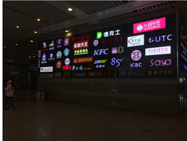
Brand logos for food and other shopping options, Hongqiao Train Station, Shanghai

canteens and noodle stalls have been partially eclipsed by a new trend of mid-range franchises.