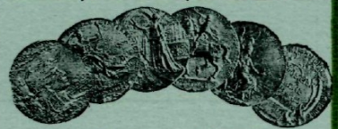
Gold Medal (Highest Award), Allahabad 1910.

GRANDS PRIX : Paris 1900, Brussels 1910, Buenos Aires 1910.