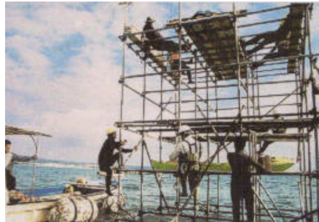
Henoko protesters occupy a platform

In October 2005, faced with the continuing opposition blockade at Henoko, Prime Minister Koizumi acknowledged that the government had been “unable to implement the (initial) relocation (plan) because of a lot of opposition.” [5] The Henoko offshore plan, like the heliport before it, was dropped. It was an admission of defeat by the state, and a tribute to the determination and persistence of the local coalition. It deserves to be recorded as one of the remarkable events in recent Japanese history: in a decade-long contest, Okinawa’s “Asterix” and “Obelisk” had defeated the nation state.