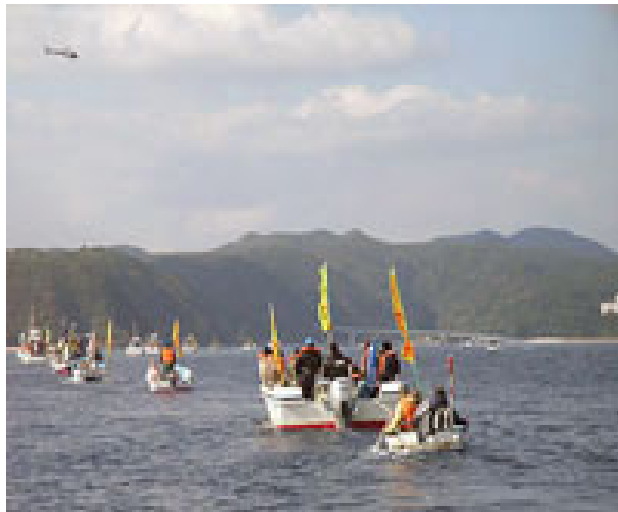
Henoko protest boats

continued without let-up for over one and a half years at the site. At a makeshift tent headquarters, Okinawan elders, some in their 80s or even 90s, mingled with fishermen and townspeople from around the island, while fishing boats, canoes, and even hardy swimmers, conducted an offshore “blockade”. All that the state’s survey team could manage to accomplish in that time was to count the dugongs (between 30 and 50) and erect four lighting beacons, which had to be dismantled with each typhoon. [4]