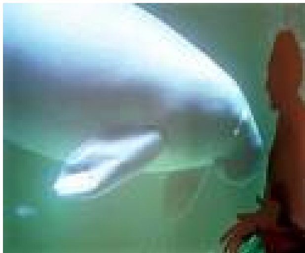
No base henoko

American tenant, for continuing to occupy Okinawan lands. Japanese officials, including then Chief Cabinet secretary and now Prime Minister Abe, lied in the parliament to cover up the deal and those who attempted to reveal what was going on were savagely prosecuted. [7] In similar vein, once again the Japanese government now promises to pay huge sums for the Futenma “reversion.” In the 2006 version, the replacement facility would comprise a large new base complex, to be built at Japanese expense at Camp Schwab, an existing US facility on Cape Henoko in close proximity to the abandoned offshore site. It would include a “V”-shaped runway of 1,800 meters, partly on land reclaimed from Oura Bay and partly on the reef, plus a pier and storage facilities where US nuclear aircraft carriers could be comfortably accommodated. [8] The heliport of 1996 had thus become a vast air and marine, military complex, with its own port and two runways instead of one.