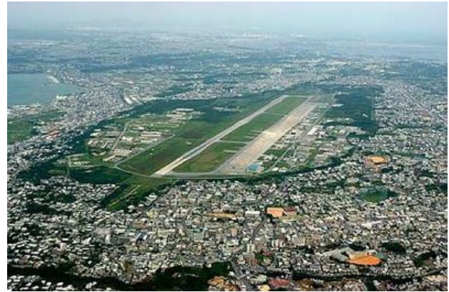
Futenma and environs

Okinawa’s capital, Naha and Okinawans continue to resist the proposed base extension at Henoko. The November 2006 election constitutes a renewed attempt to solve the festering Futenma problem. Will Okinawa be “disposed of” a fifth time?