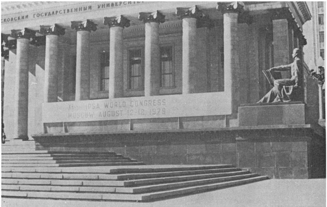
The University of Moscow, site of the IPSA XI World Congress.

It is the determined tradition of IPSA to have the Association itself, and not the host organization or any other group, maintain complete control of the preparation and development of the program. This tradition was maintained in Moscow as in Edinburgh, Montreal, Munich, etc. Once a certain cohesion and overview has been attained by the work of the Committee, scholarly freedom takes over. Each theme convenor who has been selected, each special meeting convenor who has been accepted, and each Research Committee which has been recognized by the Association is left free to develop stimulating sessions within the broad guidelines established by the Programme Committee. These guidelines urge the convenors to leave their sessions open for proposed papers as