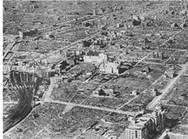
Aftermath of Osaka firebombing

Aside from evacuating civilians, the Japanese government's ineffectual efforts to defend cities against air attacks seem in retrospect more like "spiritual mobilization." 134 "Before the bombing started we saw more and more U.S. reconnaissance planes passing in the sky over Amagasaki," recalled Kuroshima Anto. "The city was on their return route from scouting Itami Airfield, and they flew so low we could even see the faces of the crew." 135 Antiaircraft artillery had virtually no effect and fighter-interceptor planes were nowhere in sight. Teruya Shūshin recalled that "thousands of shells were fired from antiaircraft guns lacking the range to come anywhere near planes that flew over ten thousand feet. It was pitiful." 136 Only the propaganda remained stalwart. Newspapers and posters gave upbeat instructions with manga -like illustrations urging city residents to cover their lamps with black cloth at night and to join volunteer firefighters in bucket relay drills. Neighborhood associations organized housewives to train with bamboo spears in case the enemy landed. Newspaper headlines and poster captions proclaimed, "Firebombs can't scare us," and "This is how we'll defend our cities." 137 More pointed criticism of the Japanese government came from Osaka resident Higa Hanako who, after hearing the emperor's surrender radio broadcast on August 8, 1945, reflected on "all the lives that could have been saved if he'd only made it earlier." 138