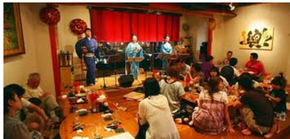
Okinawan folk music performance at Osaka restaurant

In the resulting “secondary migration” on the mainland, the largest population of Okinawans moved from Osaka to Amagasaki, just across the Kanzaki River, where their numbers increased nearly tenfold between 1935 and 1940, from 1,281 to 11,462. 9 As in Osaka a decade earlier, they began organizing, at first in friendship societies of people from the same Okinawan locality. These merged in 1940 into the Amagasaki League of Okinawa Prefectural Associations, which consolidated after the war to become the present Hyōgo Okinawa Association, with a membership of approximately 5,000, according to a recent survey. 10 During and after the war, it provided counseling free of charge to Okinawans seeking employment, negotiating with employers, applying for government permits or benefits, starting businesses, or trying to earn a living after their family breadwinner had died in the war. 11