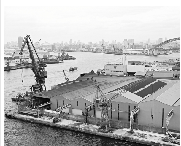
Factories in Taishō Ward, Osaka