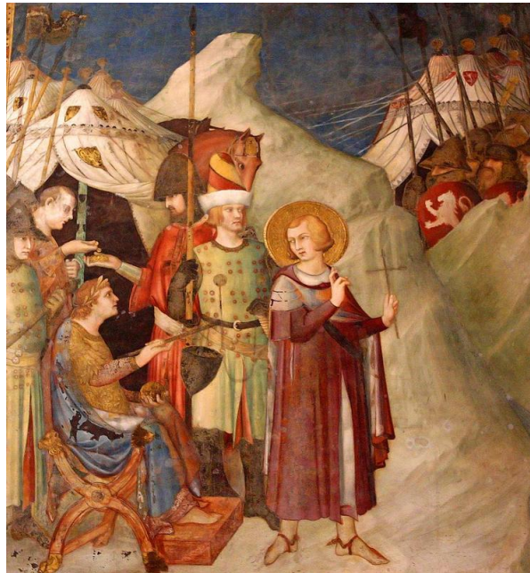
Simone Martini, St Martin Renounces his Weapons' c. 1320, Basilica di San Francesco, Assisi

The role of St Augustine (AD 354-430) has been subjected to similar distortion: in many accounts, his greatest contribution was to resolve the dilemma faced by early Christians between their temporal and spiritual obligations by formulating the doctrine of the Just War, of which he is said to be the 'father'. Yet nowhere in Augustine's abundant writings is this doctrine spelt out clearly and he would not approve of the use which has been made of his words to justify numerous wars. In his great work The City of God , Augustine was far more eloquent on the subject of peace. 'In the city of man as well as in Heaven,' he wrote, 'there is a desire for peace which may be achieved on earth to some degree. Even the warrior who had to take up arms,' said Augustine, should regard 'the prevention of shedding blood as his real mission'. Man's nature moves him powerfully 'to maintain peace with all other men as far as he is able', and anyone who can contemplate warfare without heartfelt grief has 'lost all human feeling'.