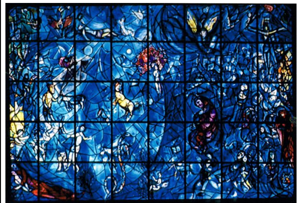
Marc Chagall, 'Peace Window', United Nations Building, New York, 1964

*This essay is an expanded version for Asia-Pacific Journal of an article published by the Oxford Research Group. The Narrative of Peace: What we can Learn from the History of Peace Thought', Oxford Research Group Newsletter, 28 Aug 2012.