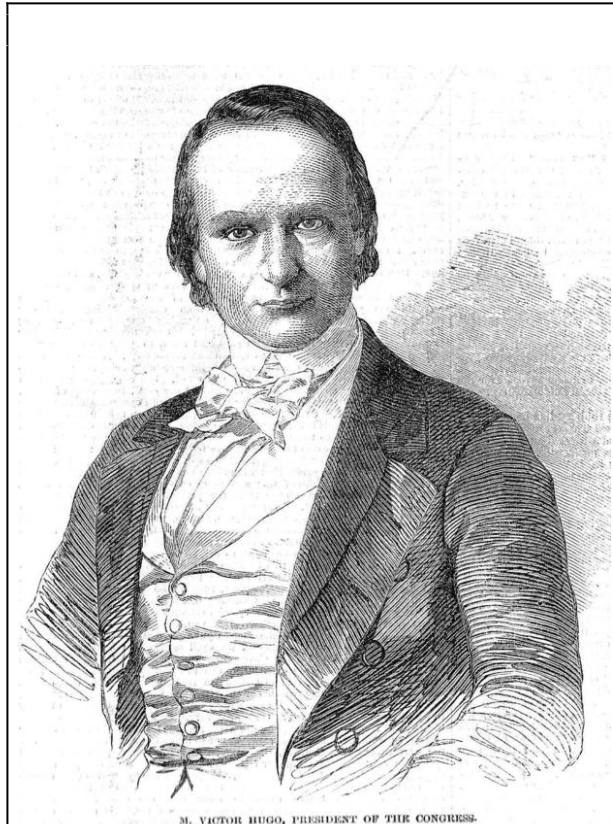
Victor Hugo addresses the Paris Peace Conference, Illustrated London News , 1 September 1849

apostles of truth, let us invoke the illustrious shadows of those who, faced by monarchs who dreamt of war, proclaimed the human right to life, the right of conscience and freedom, the supremacy of reason, the sanctity of work, and the blessings of peace. And, since the thrones of our monarchs cast us into darkness, let the tombs of these great thinkers restore us to the light!