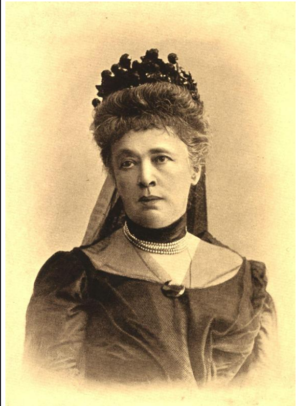
Bertha von Suttner (1843-1914), Austrian peace campaigner and novelist, the first woman to win the Nobel Peace Prize

We must understand that two philosophies, two eras of civilization, are wrestling with one another and that a vigorous new spirit is supplanting the blatant and threatening old. No longer weak and formless, this promising new life is already widely established and determined to survive. Quite apart from the peace movement, which is a symptom rather than a cause of actual change, there is taking place in the world a process of internationalization and unification. Factors contributing to the development of this process are technical inventions, improved communications, economic interdependence, and closer international relations. The instinct of self-preservation in human society, acting almost subconsciously, as do all drives in the human mind, is rebelling against the constantly refined methods of annihilation and against the destruction of humanity.