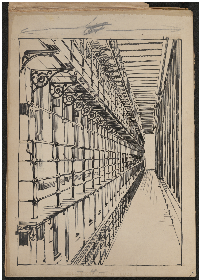
FIGURE 2. Berkman's Sketch of Penitentiary Cells

Note: Alexander Berkman, "Drawings and Prints of the Penitentiary and of an Advertisement for the 'Union Broom' Made by the Prisoners" n.d. Digital image courtesy of Alexander Berkman Papers, International Institute of Social History (Amsterdam).