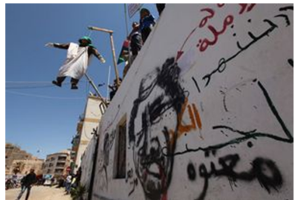
Benghazi group's Gaddafi effigy, May 22, 2011