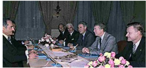
The Shah (left), Brzezinski (right), Carter (second right)

That the U.S. would support al-Qaeda in terrorist atrocities runs wholly counter to impressions created by the U.S. media. Yet this on-going unholy alliance resurrects and builds on the alliance underlying Zbigniew Brzezinski’s 1978-79 strategy of provocation in Afghanistan, at a time when he was President Carter’s National Security Adviser.