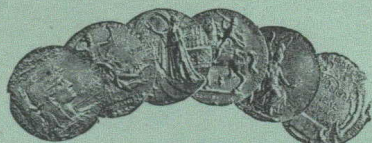
Gold Medal Allahabad 1910.

Paris 1900, Brussels 1910, Buenos Aires 1910.