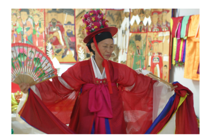
Hwanghae kut, by Kim Kŭm-hwa

The return of the art of "seeking good luck" is a notable phenomenon in North Korea. It occupies a marginal place in the analysis of