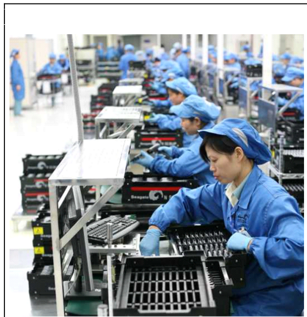
Foxconn workers on the assembly line

migration is driven by an urban-biased economic model. While there have been important, long-term demographic changes in the national working population as a result of the one-child family policy implemented beginning in the 1970s, successive generations of rural-urban migrants and the potential pool of migrants in the countryside have been and remain large. Chinese migrant workers have been incorporated within a global industrial labor regime.