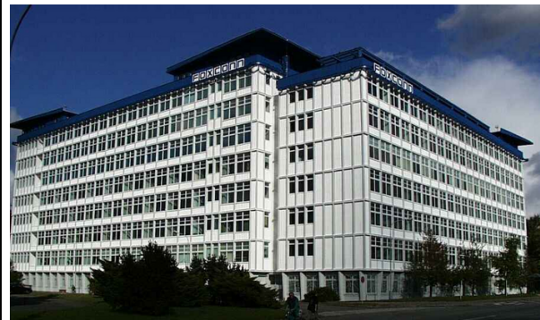
Foxconn Factory, Shenzhen

We can interpret Foxconn employees as having killed themselves to protest a global labor regime in which China provides the cutting edge. Under the reform and open-door policy, China’s export-oriented economy proved it could deliver economic growth. Asian-invested enterprises and domestic manufacturers on mainland China have risen quickly to become contractors and sub-contractors to Western multinationals, based on the exploitation of low-paid migrant workers. On the factory floor, work stress associated with the race to the bottom and the just-in-time production mode is intense. Suicide is merely the extreme manifestation of what migrant workers in their hundreds of millions experience. Some suicides may have been triggered by personal troubles, as Foxconn management would like to claim. But there is a broader social context shared by its workers and many others that underlies the desperate individual actions.