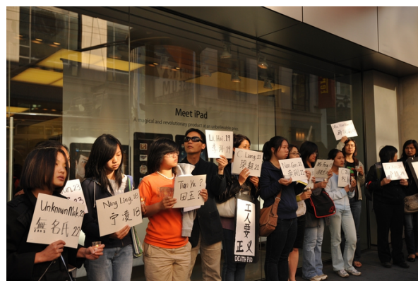
Thirteen young organizers picketed an Apple store in San Francisco on 17 June 2010. They carried placards showing the names and ages of 12 of the 13 Foxconn suicide victims whose names are known, and an unnamed placard for the 13th. They had a moment of silence for each of them. On the "DeathPad," reads "Workers want justice."

industrial accidents. 145 Still others, under desperate conditions, have taken their own lives. 146