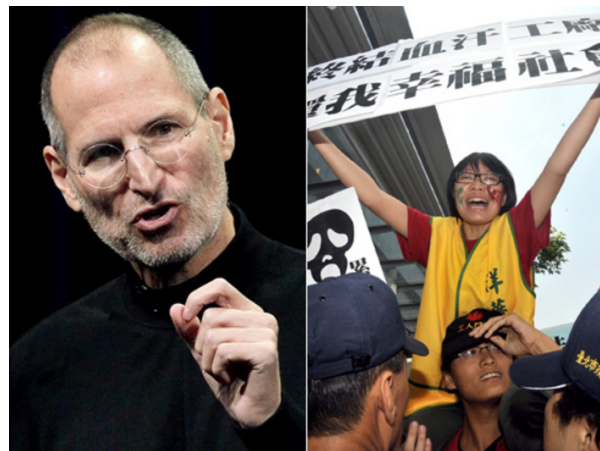
Will Apple and other corporate icons be able to distance themselves from the plight of Chinese workers assembling their products? Steve Jobs addressed the Foxconn issue at a press conference while a Chinese protester demanded equitable treatment for workers.

Apple, which enjoyed record profits amid the economic crisis, continues to seize every opportunity to secure lower prices from suppliers. Indeed, industry sources suggested that Apple awarded iPhone orders to Foxconn after Foxconn agreed to sell parts at “zero profit”. 99 Foxconn probably agreed to the deal in order to keep other more lucrative Apple contracts and to kill its competitors. It offered a rock-bottom price made possible by its big market size to secure a leading industry position. Apple revenues for the fiscal 2009 first quarter exceeded US$10 billion. 100