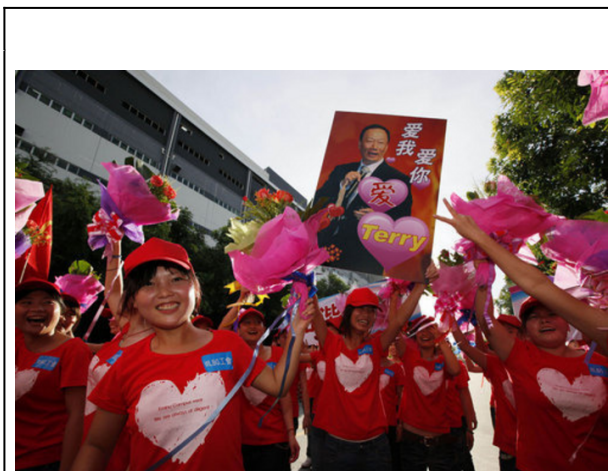
Love me, love you, love Terry

Amid new cases of young worker suicides this summer, Foxconn organized a morale-boosting rally for its young employees at a stadium in the Shenzhen Longhua plant on 18 August 2010. Some workers dressed in company-provided, pink-color t-shirts with big red words “I love Foxconn.” Others, in cheerleader costumes, held up huge posters of CEO Terry Gou that say “Love me, love you, love Terry.” 156