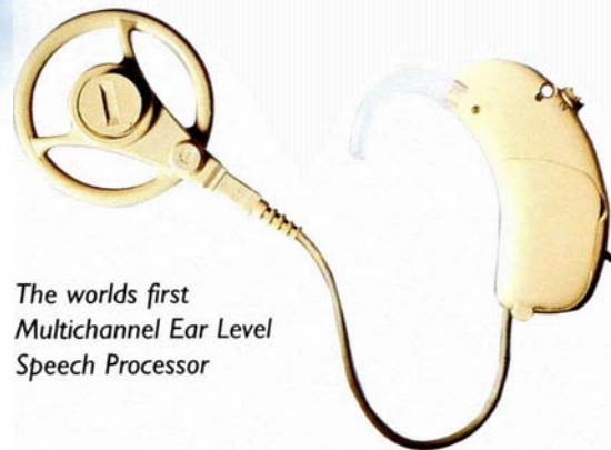
The worlds first Multichannel Ear Level Speech Processor

• The ESPririt™ further enhances the outstanding performance of the Nucleus® C124 Implant - The worlds most popular and reliable Cochlear implant.