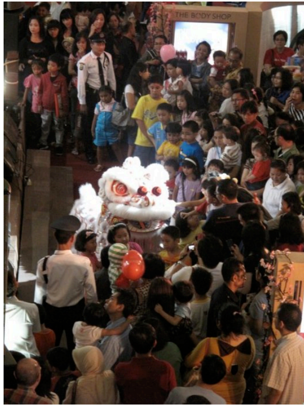
Children admire a lion dragon

The Year of the Tiger was being welcomed by lavish celebrations in several shopping centers, five star hotels and in some predominantly Chinese neighborhoods. Cultural events included traditional dances and music, as well as Chinese pop. At Taman Anggrek Mall this year's theme was Boat of Fortune with a huge 'junk regatta'.