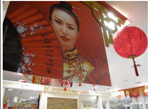
Commercializing the spring festival

One could easily point out that the capital city's businesses are using Spring Festival to increase sales and that - as is so common in Indonesia - everything is about money and very little about culture or history. On the other hand, one could say that while not everything is going smoothly (there is heavy security at all Chinese events - proof that not everyone welcomes the return of some cultural pluralism in this archipelago where the majority and its dominant religion are accustomed to rule unopposed), at least it is going!