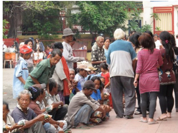
Chinese feeding Indonesian beggars

As he speaks, the sound of prayers is coming from the temple. Dozens of beggars, many old and some small children but none apparently of Chinese descent, are lining up along the access road asking for money or food. Chinese men and women are taking boxes of food and donations from the temple, distributing gifts equally among the growing crowd dressed in rags.