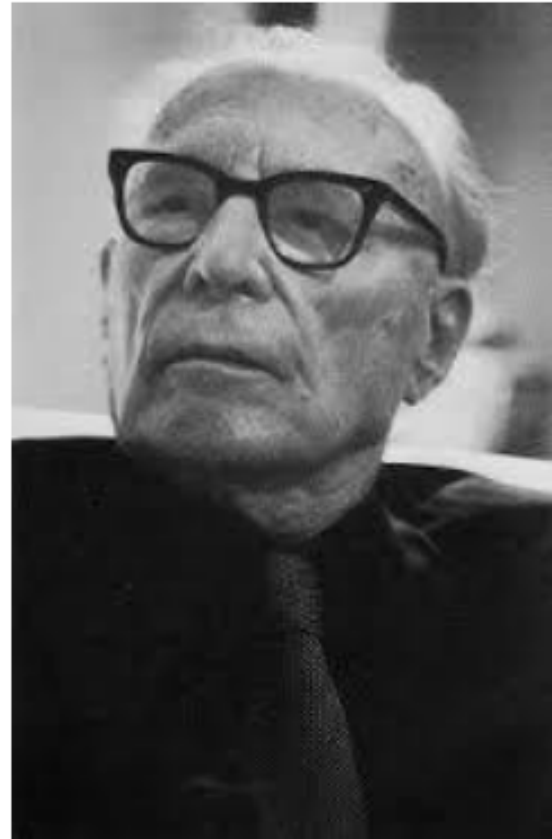
Karl August Wittfogel

Schwartz's challenge to a generic "totalitarian model," applicable to Communist and fascist regimes alike, elicited dissent from its defenders. 10 The most acerbic was a series of diatribes penned by Karl August Wittfogel, a former German Communist who had fled Hitler's Third Reich to become a vocal critic of Communism in both the Soviet Union and China. A professor of Chinese history at the University of Washington, Wittfogel had gained notoriety in the field by accusing fellow Sinologist Owen Lattimore of Communist sympathies at the McCarran hearings on the "loss" of China. 11 In Wittfogel's view, Chinese Communism was a carbon copy of Russian Communism. He rejected the notion that Mao Zedong had been an innovator in any sense of the word; every strategic move and ideological justification that marked the Chinese revolutionary experience, he insisted, could already be found full-blown in Leninism. For Wittfogel, Chinese Communist doctrine did "not exhibit any originality, 'Maoist' or otherwise." 12