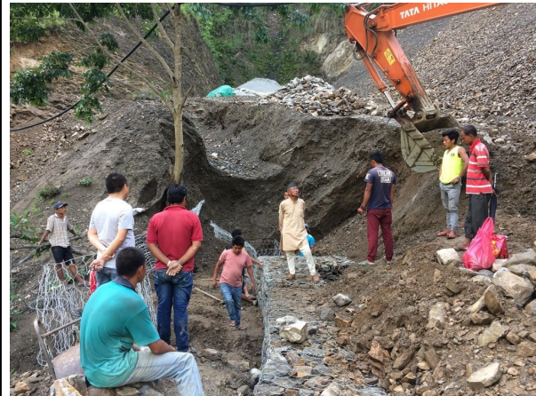
Road construction continues amidst pandemic in rural Nepal

I also place hope in communities' spirits of solidarity and compassion, as this has been a key source of resilience in survival and recovery from the disastrous 2015 earthquake. After the lockdown was eased on June 20, I visited a village in the Roshi rural municipality of the Kavre district, making sure that I adhered to the rules of social distancing, mask-wearing, and hand washing. From the conversations I had with the people, I realized that while the community is anxious about the uncertain situation presented by the global pandemic, they are also dedicated to community solidarity and do what they can to extend support to one another. As soon as the lockdown was imposed, families called back their relatives working in cities. With the return of young people to villages, the atmosphere in these places revived somewhat, regaining a welcome vibrancy. They plowed some of the abandoned terraces for maize and vegetable cultivation and village religious rituals continued with necessary precautions. When I visited the village, road construction was ongoing. Now they have restricted interaction with outsiders, but they are confident that they can still manage to support the relatives yet to return from abroad and are ready to welcome them back into the community.