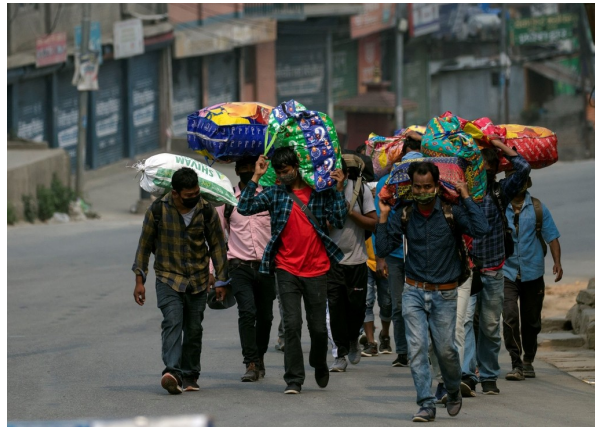
Wage workers from Bardiya, Kailali and Kanchanpur returning home by foot from Kathmandu after the government imposed lockdown