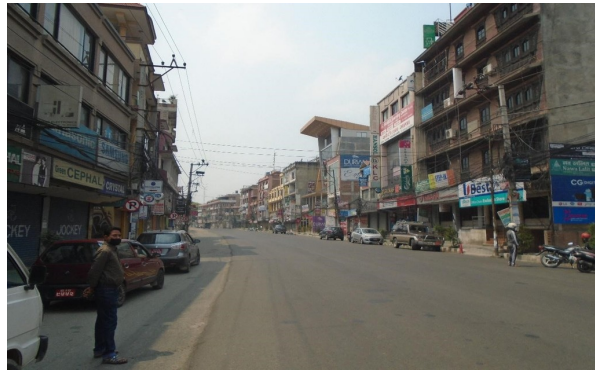
Lockdown Scene in Kathmandu