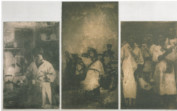
Shimada Yoshiko, "White Aprons" from the series "Past Imperfect" 1992

"Past Imperfect" explored the extent to which Japanese women had participated in and strengthened the war effort—and the costs of that collaboration to themselves, to other Japanese women, and most of all to Asian women. She chose as her symbol for their enthusiasm the white aprons, or kappogi , that wartime Japanese patriotic women's organizations had adopted. Using old photographs of these mothers holding smiling babies, waving flags, and lighting the cigarettes of soldiers, she created collages that commented on their choices. Her critique was made sharper by the border around one of these collages, which incorporated photos of young "military comfort women." As she explained, "I realized that Japanese women were not entirely the voiceless victims of male-dominant militarism. Many were enthusiastic fascists and willing to sacrifice themselves and to victimize others in the name of the emperor." 26 This project emphasized the ways that wartime Japanese women were drawn into the conflict as mothers of soldiers, a form of recognition that simultaneously celebrated them and severely limited their life choices, while also noting that Asian women were assigned far harsher tasks.