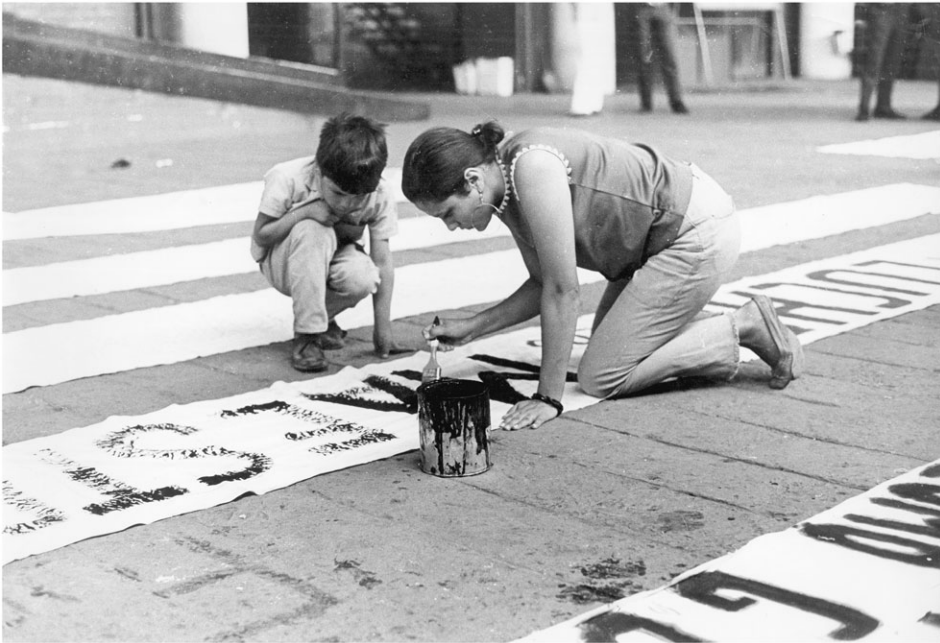
Figure 7. Woman painting a sign for the march on June 10, 1971.