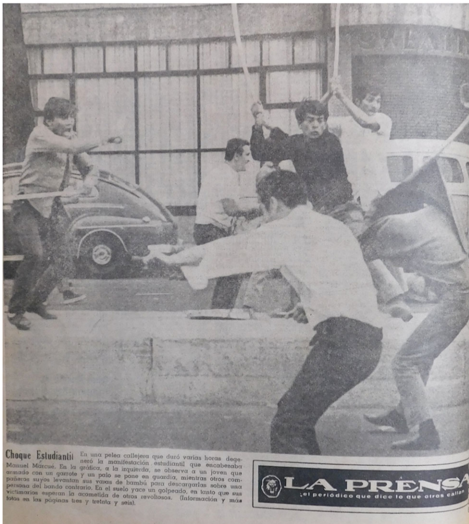
Figure 2. The repression of the students. La Prensa , June 11, 1971.

The strategy of most of the press focused on showing the figure of the nation's leader with the support of his people. Obviously, the only point of view chosen was that of power itself.