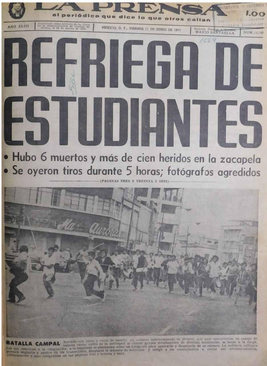
Figure 1. Los Halcones. La Prensa , June 11, 1971. Lerdo Library/SHCP.

as the “extremism” of leftist and rightist groups ( El Heraldo de México 1971, 1). On June 14, just three days after the massacre, the government organized a giant rally in support of the president in front of the National Palace, the seat of power. It convened various unions and peasant organizations that applauded and cheered Echeverría. The press massively publicized this event and positioned it in the public opinion as a true refounding of the nation ( La Prensa 1971, 1).