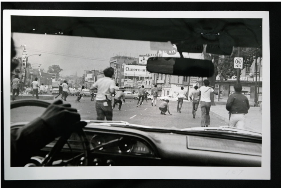
Figure 9. "Halcones." Box 1266B, exp. 4, General Directorate Fund for Political and Social Research, AGN.