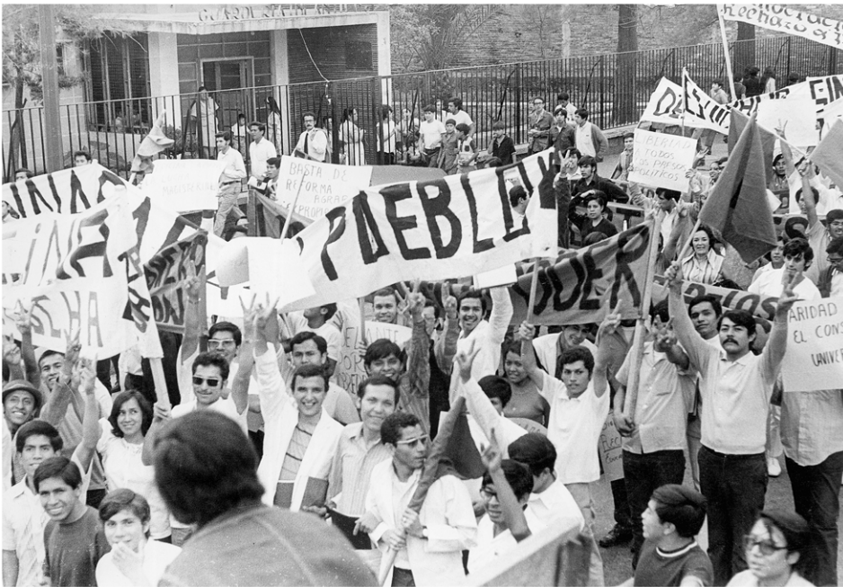
Figure 6. The march on June 10, 1971.