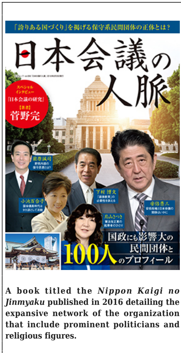
A book titled the Nippon Kaigi no Jinmyaku published in 2016 detailing the expansive network of the organization that include prominent politicians and religious figures.

Japanese political lobby, with deep ties to Prime Minister Abe and the ruling Liberal Democratic Party.