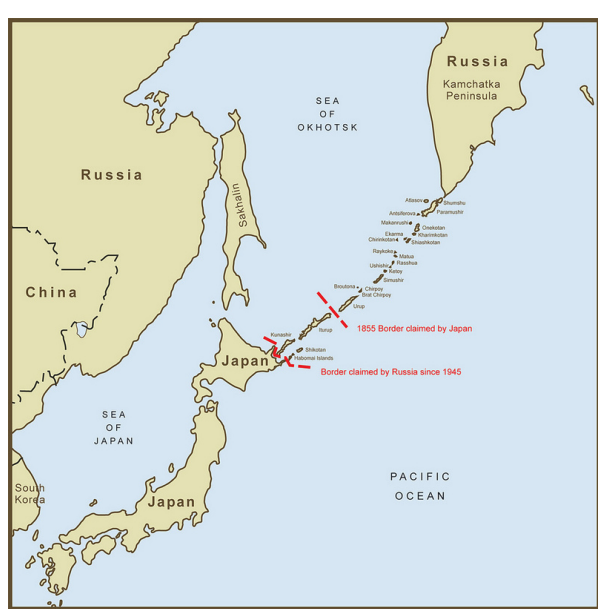
Map of the Kuril Island chain detailing pre-and post-WWII boundaries.