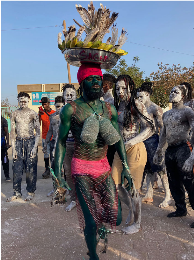
Figure 4. Zora Snake and collaborators.

figure was neither male nor female, human nor animal, but staked claim to an elusive in-between space. As he traversed public space with a group of dancers covered in white plaster, he not only disrupted traffic but equally disrupted assumptions about what makes a body masculine or feminine, a being human or animal.