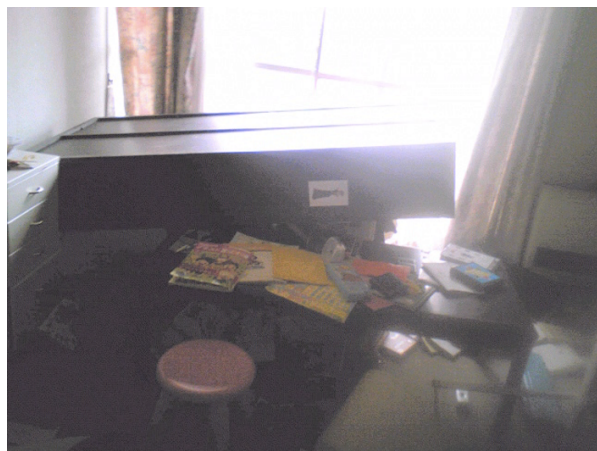
Open china cabinet with broken crockery and glass, fallen bookcase

“Sugoi!” she exclaimed, and so it was. The china cabinet had popped its doors and half the