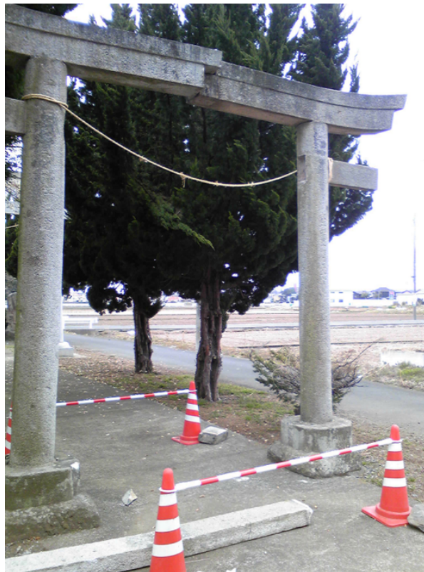
A fractured and dislocated Shrine torii gate with the second crossbeam on the ground, Tsukuba, Ibaraki

I write this by candlelight. Interesting times.