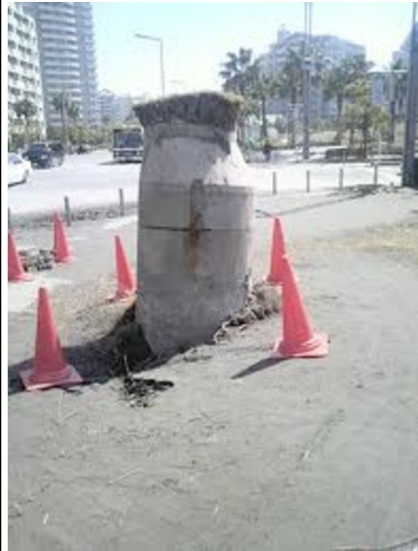
"Manhole Tower", Urayasu, Chiba

And that is not all. Closer to our home, Urayasu City in Chiba is literally sinking. When the quake caused the reclaimed land to settle underneath the pavement, water rushed to the surface and flushed through roads and walkways. There are now "manhole towers", and homes still lack the basic utilities: water, electricity, and cooking gas.