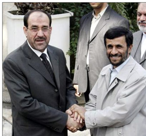
Prime Minister Nouri Al-Maliki (left) greeted by Iranian President Mahmoud Ahmadinejad on his first visit to Tehran

The three-day visit to Tehran by Iraqi prime minister Nouri al-Maliki in August 2007 (his second in a year) is awkward for the US government; not least, it contributes to the political chaos in Baghdad by alienating further the leading Sunni political representatives who have resigned from the government (a situation which the Shi'a -Kurdish deal announced by Iraq's president, Jalal Talabani, on 16 August is unlikely to reverse).