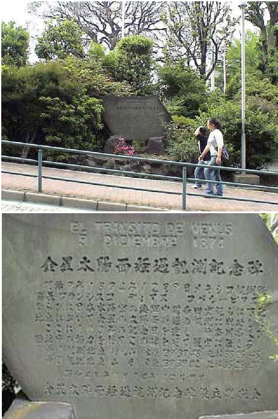
Figure 7. Masonry slab upon which one of Díaz Covarrubias' telescopes stood, engraved as a plaque remembering the Mexican expedition. This plaque is displayed in a Yokohama public park.