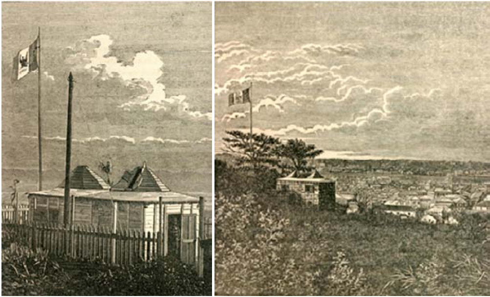
Figure 2. (left) The observing station at Nogue-No-Yama. (right) The observing station at “The Bluff”.

coordinates of the stations, as well as to have accurately calibrated chronometers. They proceeded therefore to the determination of times, latitudes and longitudes (both absolute and differential). For the times, they observed meridian passages of a number of stars, for the latitudes they used four different methods (among them the so-called “Mexican method”, developed by Díaz Covarrubias), and for the absolute longitudes they observed lunar culminations, occultations of stars and culminations of about 55 stars. They also exchanged a number of telegraph signals with Tisserand, and Davidson, of the French and American stations. The final results of these determinations, as given in the original publication, (Díaz Covarrubias 1875) are displayed in Fig. 3. The “Legación de Rusia” point was included at the request of O. W. Struve who was in Yokohama to observe the transit.