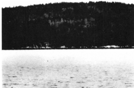
Figure 4 — Bedford Basin, Nova Scotia (Chibouctou) Near the d'Anville anchorage