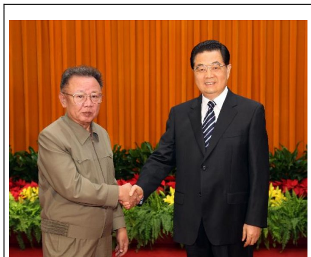
Figure 2: Kim Jong Il with China's Hu Jintao on May 20, 2010

However, after the false charge over the Cheonan Incident, North Korea completely changed its attitude. Having the great cause that the US and South Korea were to blame for the false charge, it began to openly criticize the evil acts of the US and South Korea in forums like the UN. A high Iranian official, who has repeatedly criticized US for falsely charging that Iran was developing nuclear weapons in the UN and elsewhere, began to praise North Korea, saying that Iran and North Korea "are both independent revolutionary nations, trying to resist the world's 'greedy powers.'" [Iran, North Korea share common goals]