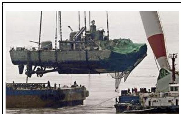
Figure 1: A giant crane lifts the stern of the Cheonan

Democratic People's Republic of Korea (North Korea) for the Cheonan incident, which took place in late March, leading to intensification of the conflict between North and South. Influenced by this, the handover of occupational command (OPCON), from the US to the South Korean military, which had been expected to occur in 2012, has been postponed until 2017 or sometime thereafter. In Japan, the move of the US military in Okinawa to Guam, which had been planned to take place by 2014, is likely to be postponed until sometime after 2015, because of the inability to resolve the Futenma Base issue and the delay of base construction on Guam. 60 Years Into War, US Delays South Korea Forces Handover