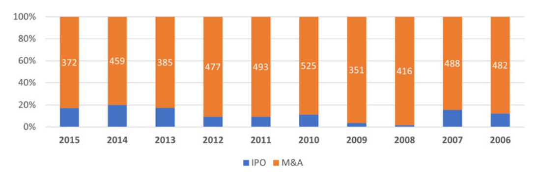
Figure 3. US's VC Exits via IPO and M&A Data Source: National Venture Capital Association<sup>181</sup>