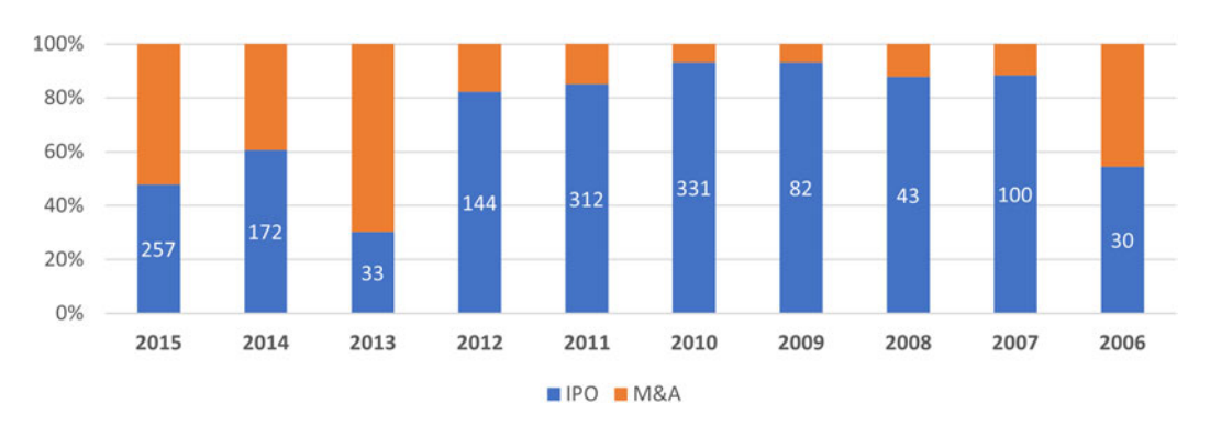
Figure 4. China's VC Exits via IPO & M&A Data Source: Zero2IPO & China Venture<sup>182</sup>

Seeing this contradictory trend, which route would more likely be the future of VC exit in Cambodia? In the report 'Startup Kingdom: Cambodia's Vibrant Tech Startup Ecosystem in 2018', the survey showed that most investors believe exit opportunity is just a minor issue. <sup>183</sup> Even though the capital market is not robust yet, the trade sale to strategic acquirers and later-stage funds is considered a more direct path for exits. <sup>184</sup> Despite this, there is currently no major development in Cambodia regarding startup exits through M&A, and the current situation gives rise to legal ambiguity for such transactions. To date, there is no law specifically governing M&As. <sup>185</sup> Therefore, what should be the right approach to engineer the related legislation to promote M&A exit for VC-backed startups in Cambodia? The discussion below will address such M&A-related regulations based on three legal frameworks: antitrust law, company law, and tax law.