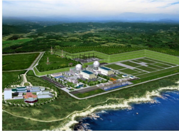
An artist's impression of South Korea's Shin-Kori 3 and 4 reactors

enable Korean firms to meet the Ministry of Education, Science & Technology's target for the country to develop its nuclear industry into one of the world's top five by 2011, and allow it to compete even more forcefully in the global market.