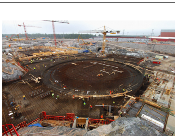
AREVA's troubled Olkiluoto 3 reactor development in Finland.

In addition to the direct economic benefits there could be trickle-down effects throughout the wider economy. UAE officials have stressed that 60% of the workforce to operate the plants will be Emirati nationals who will be trained both overseas and at Abu Dhabi's Khalifa University. This should also lead to the development of specialised human resources in other areas, and should greatly spur the diversification of the Emirates economy away from a reliance on oil exports. The agreement calls for the first phase of the scheme to start delivering nuclear energy by 2017, with the four plants eventually meeting up to 25% of the country's electricity needs after 2020 when all are scheduled to be operational.