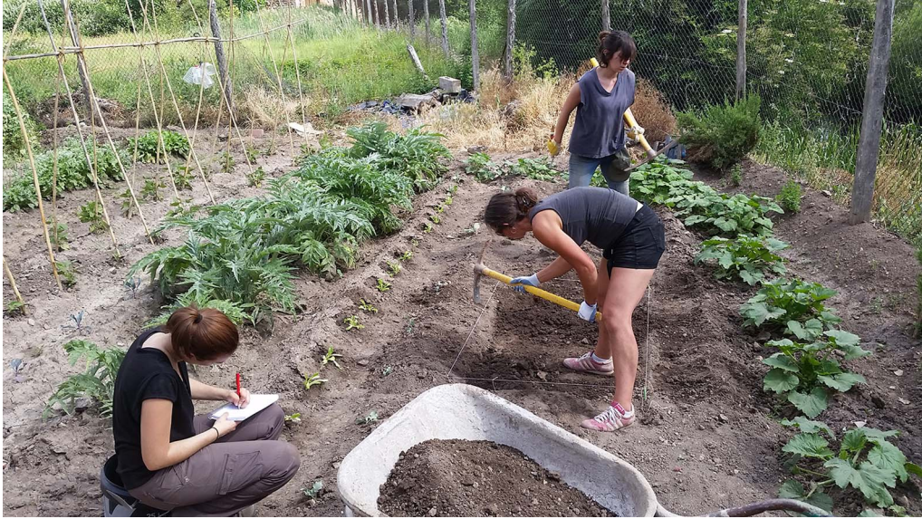
Figure 5. Excavations of a medieval irrigation channel in the town of Molina de Aragón (figure by Aleks Pluskowski).

the ability of conquered communities to adapt to the imposition of a new regime. Environmental exploitation is an increasingly used index of this resilience. From this, the LoR project will develop visual and digital resources to enable public beneficiaries to engage with the cultural landscapes associated with the iconic monuments of frontier authorities.