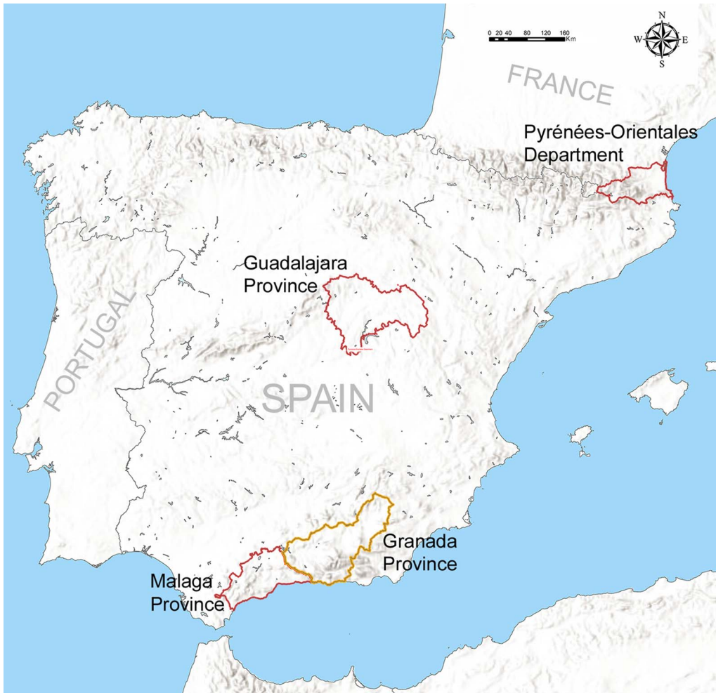
Figure 4. The case-study regions in the ‘Landscapes of (Re)Conquest’ project, showing the three primary regions and the secondary study region of Granada (figure by Aleks Pluskowski).

archaeology remain segregated from each other, more broadly from historical research, and from how these sites are presented to the public. We will integrate animal and plant remains, alongside palynological, geoarchaeological and biomolecular data, as well as the better-known historical sources, to map changes in natural resource exploitation and their connections with social and ideological transformations associated with regime changes in our selected case-study regions (Figure 5). One of the most important indicators of these changes will be long-term changes in diet based on multi-proxy data. Food culture in frontier societies connected the dietary choices of individual households with nearby rural provisioning and longer-distance trade networks (e.g. García García 2019).