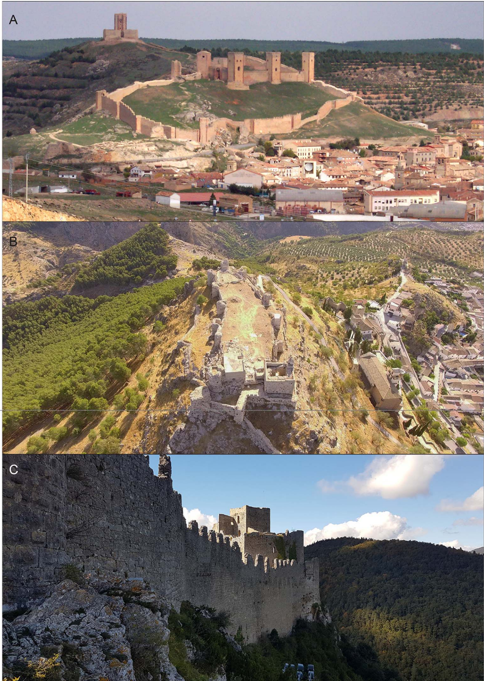
Figure 2. The castles that functioned as centres and symbols of frontier authority: A) Molina de Aragón (Guadalajara) ( https://es.wikipedia.org/wiki/Real_Sc&per;C3&per;B1or&per;C3&per;ADo_de_Molina&hash;/medialArchivo:Molina_de_Aragon2.jpg ); B) Moclín (Granada); C) Puilaurens (Occitanie) (B–C by Aleks Pluskowski).