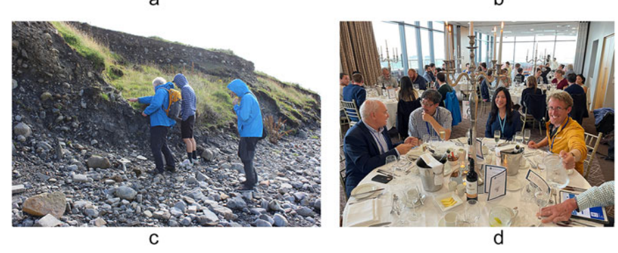
Figure 1. (a) The small Skellig island, en route to Skellig Michael. (b) The tetrapod trackway on Valentia Island, here viewed in 2011. (c) Inspecting till on Scattery Island. (d) Two of the editors at the conference dinner.