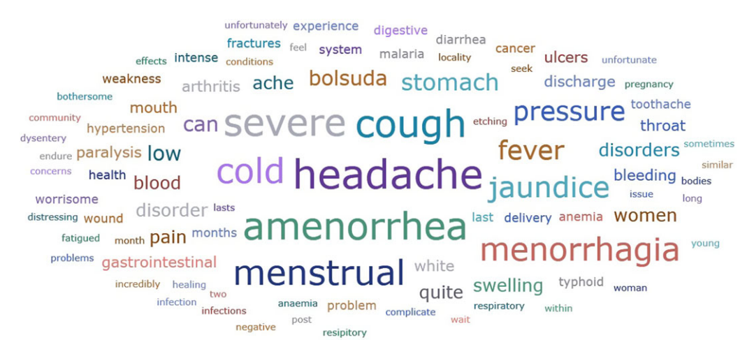
Figure 2. Word Cloud of Different Types of Health Issues Faced by Garo Women Participants, East Garo Hill District, Meghalaya (Primary Qualitative Field Survey During May 2023).

'Ma'am, I got the LPG gas cylinder under the Ujjwala Yojana, but only the first one was free. After that, we have to pay for the cylinders, and it's really hard for my family to afford it. The cost is too much for us, so I use wood for cooking because it's easier to get and doesn't cost money like the gas does'. -----(48 years old Garo women)