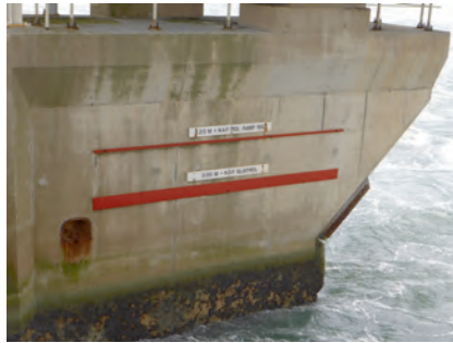
Figure 1.6 Left: The Oosterscheldekering at Neeltje Jans. Right: Its 3 m and 4.20 m storm-surge markers.

event for the closure of the barrier, namely when the sea level at a line between Stavenisse and Wemeldinge, well within the Oosterschelde, reaches 1 m above NAP.