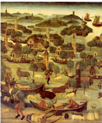
Figure 1.2 Left: Flood marks in the delta area of Zeeland. Right: The Saint Elisabeth flood of November 19, 1421, Master of the Saint Elisabeth panels.

About a third of The Netherlands lies below sea level, with about two thirds being prone to flooding. The lowest point of The Netherlands, standing at minus 6.76 m, is Nieuwerkerk aan den IJssel (after a merger, now referred to under its new name Zuidplas). It is situated about 10 km northeast of Rotterdam. Under such extreme topographic conditions, an understanding and communication of (especially) flood risk is highly relevant and "living with risk" becomes very tangible. Historically, the protection of the country by coastal as well as river dikes has always been of eminent importance. Below we will give a brief discussion of the world famous Delta Works project, which finds its origin in the 1953 flood event. First however, let us define what we understand by the above "minus 6.76 m". For that, one clearly needs a proper gauge. In the case of The Netherlands, this is the NAP = "Normaal Amsterdams Peil", a well-defined North Sea average level, also referred to as the Dutch National Ordnance level; see Figure 1.3. NAP is also officially the zero level within the European Union. Storm surges and low/high geographical points are always recorded and communicated relative to the NAP. In the case of the 1953 flood, the highest water level reached at Hoek van Holland was 3.85 m above NAP whereas for Zeeland this was 4.55 m above NAP.