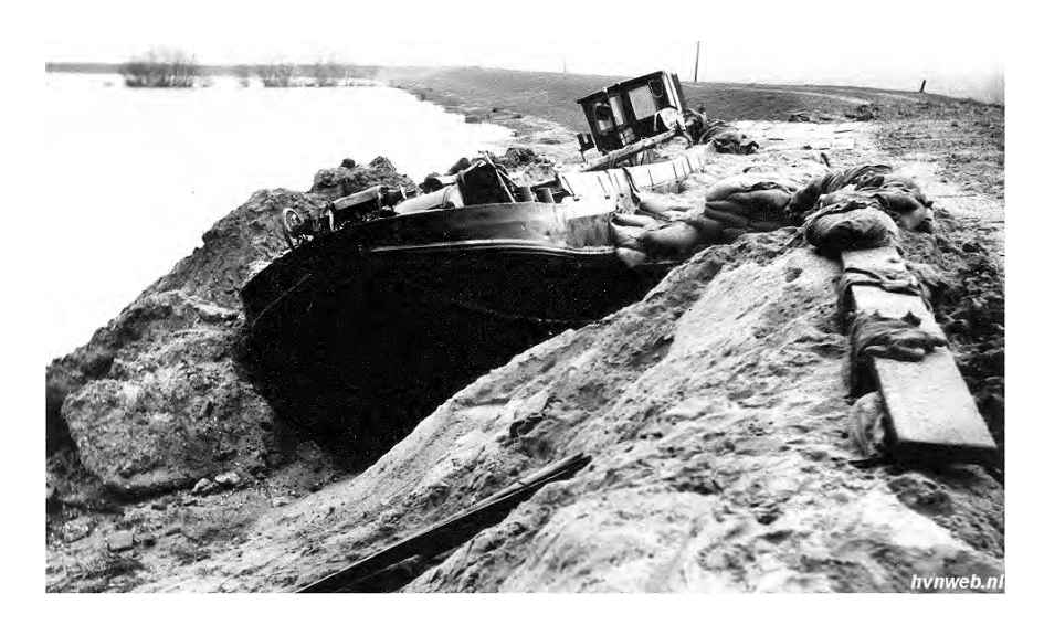
Figure 1.4 Plugging a hole in a dike near Nieuwerkerk aan den IJssel with the boat De Twee Gebroeders.

stated in Gerritsen (2005): "Until the middle of the twentieth century, a dike was largely characterized by its height. Very little was known about the factors influencing its strength or failure mechanisms. [...] The dike height was simply the height of the highest recorded high water plus a safety level of approximately half a meter." Whereas a combination of statistical analyses based on historical data combined with the strengthening of individual (typically smaller) dikes still played a very important role, the Delta Plan contained in particular the construction of major new dams and barriers (13 in total) across the southwest delta area of The Netherlands; see Figure 1.5.