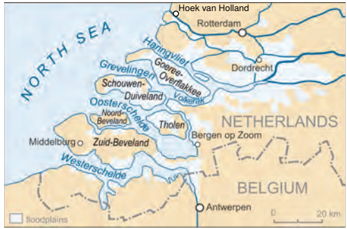
Figure 1.1 Left: The 1953 great flood in Zeeland and Holland. Right: The area flooded where we have additionally pointed out the location of Hoek van Holland.

had taken their course. In The Netherlands alone, 1836 people died that night with most of the deaths occurring in Zeeland. Across the east coast of the UK, the coast of West Flanders (Belgium) and at sea, at least a further 500 casualties had to be added. In total, 9% of total Dutch farmland was flooded, 30 000 animals drowned and 47 300 buildings were damaged of which 10 000 were destroyed.