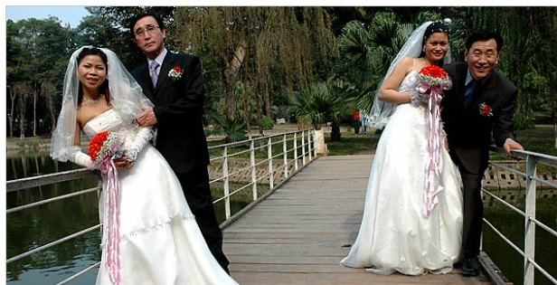
Korean men marry Vietnamese women in Vietnam

The proportion of intermarriages in total marriages in Korea has jumped more than ten-fold since 1990, accounting for nearly 14 per cent in 2005. This coincided with the growing number of migrant workers in Korea (see Table 2). The soaring number of international marriages is also due to a significant growth in the number of "picture brides" from abroad.