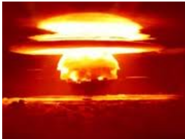
The Bikini blast

The ocean at night, dyed the colors of sunset, then the rumbling, and—two hours later—the white ash falling: I felt as if I had experienced it along with that young man and wanted to visit him in the hospital and hear from him firsthand. But when I boarded the train, I became absorbed in that persimmon-bound book.