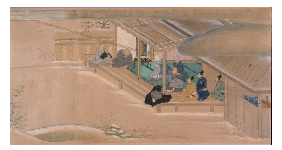
Figure 1. Scene of the "deadbed ceremony" practiced by the monk Ryuken Risshi, Detail of the Scroll of the Illustrated Biography of Monk Honen , 14<sup>th</sup> century, Chion-in Temple, Kyoto