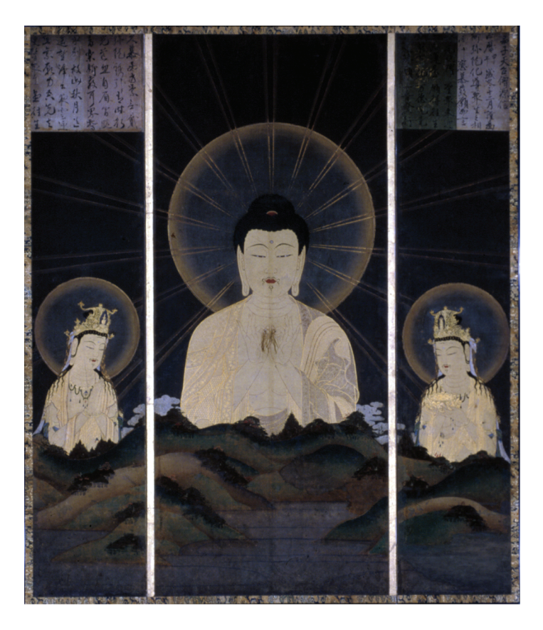
Figure 2. Screen painting of Yamagoe Amida zu, 14<sup>th</sup> century, Konkai-Komyo-ji, Kyoto