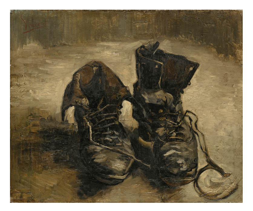
Figure 5. Vincent van Gogh, Shoes, 1886, Van Gogh Museum, Amsterdam.

specifications for the application of Grant-In-Aid for Scientific Research every five years. Currently art history is classified under "aesthetics and art history," under the branch of philosophy in the field of the Humanities, under the course of the Humanities and Social Sciences. From 2008 on, a new branch of arts was established that includes as its specification "study of the arts, history of the arts, and arts in general." For the 2013 revision of this classification, art history runs the danger of being