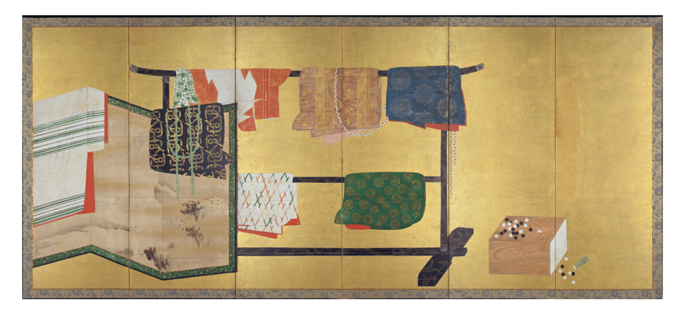
Figure 4. Tagasode byobu (left pendant to the pair of Screen paintings), 17<sup>th</sup> century (?), Suntory Museum of Art, Tokyo