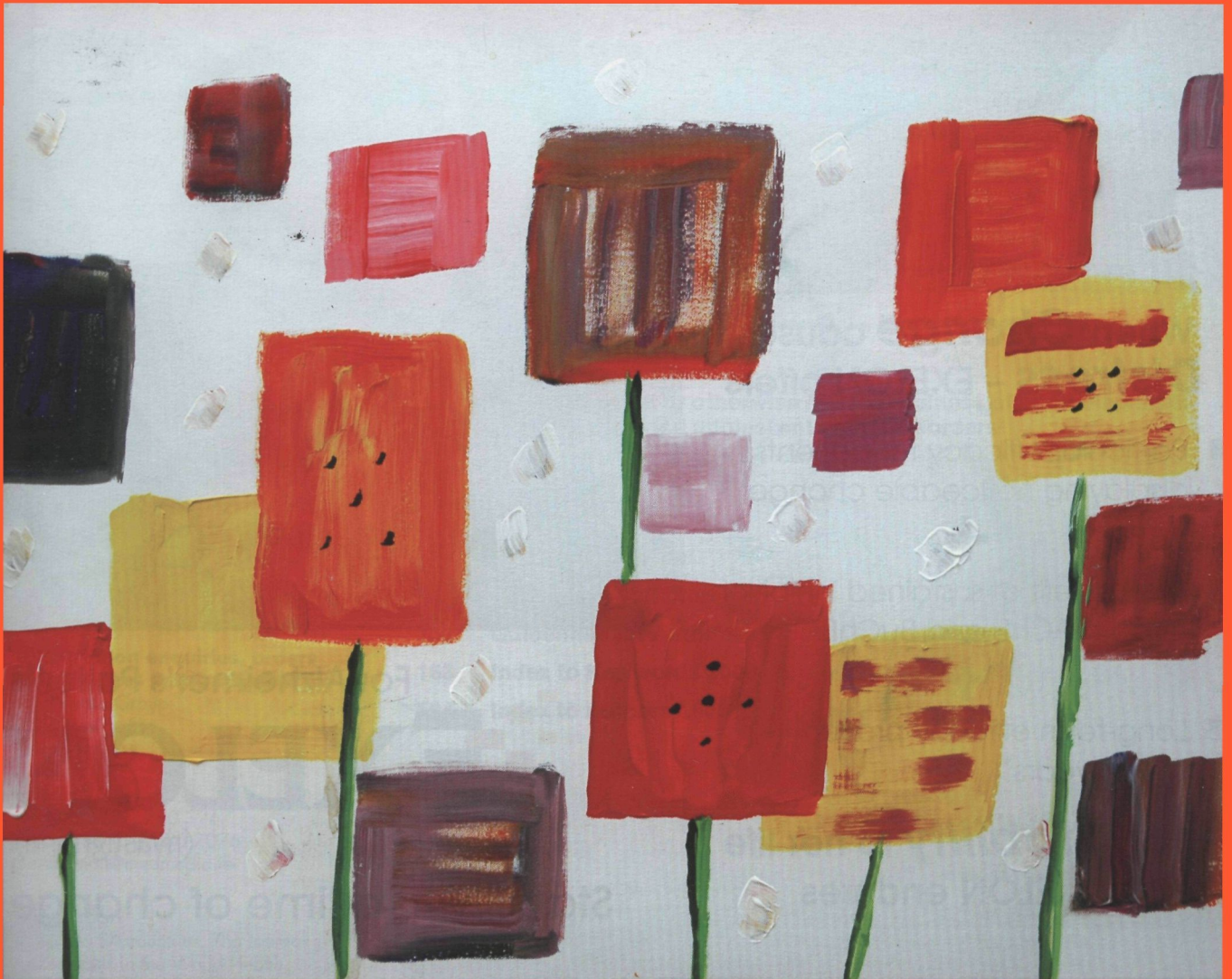
'Poppies' by AL. Acrylic (36" x 24")