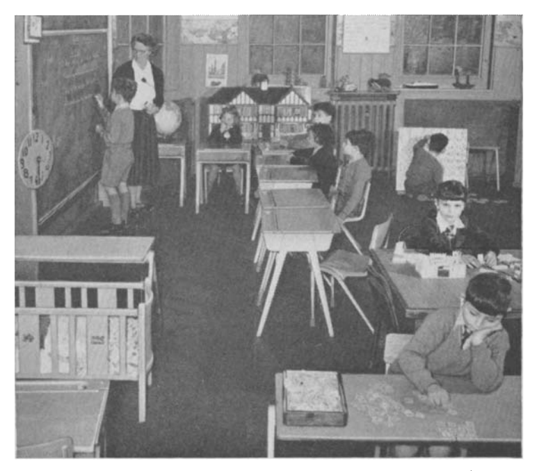
The Kindergarten Class at the London Residential School for Jewish Deaf Children where all classrooms have been installed with the Multitone Telesonic Induction Loop System