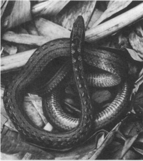
Red-bellied racer ( A. rufiventris) from Mt Scenery, Saba.

Scenery on Saba; on Statia we found racers at higher elevations of the Quill (550 m).