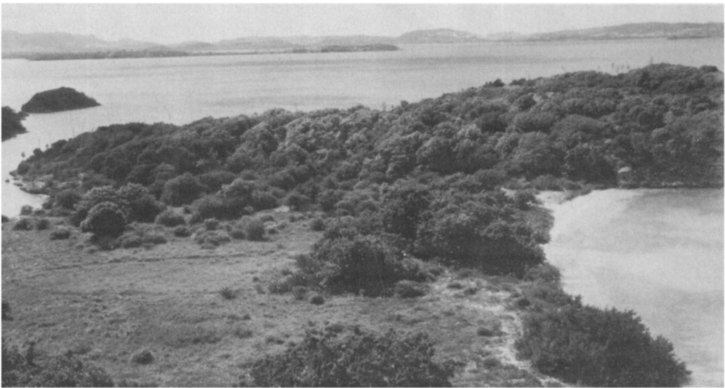
Great Bird Island: racer habitat ( R. Sajdak ).

four islands (combined area 302 sq km). It is now found only on Saba and Statia (33 sq km combined); 10.9 per cent of its original range.